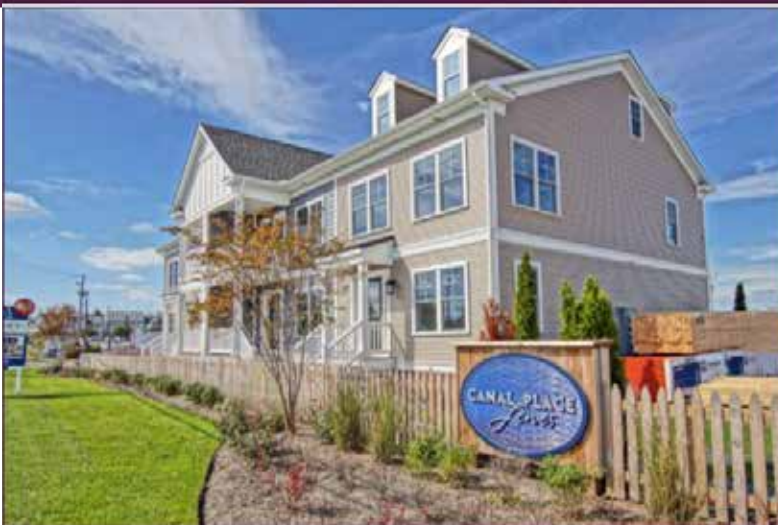
Evergreene Builders presents Canal Place at Lewes

Luxury townhomes, distinctive features, starting in upper $400Ks Pool community | Walk to Historic Lewes & the beach!