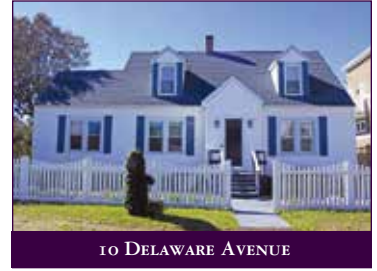
10 DELAWARE AVENUE