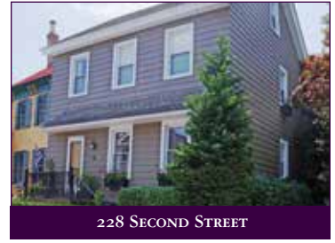
228 SECOND STREET