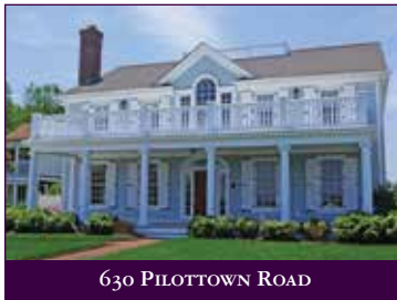
630 PILOTTOWN ROAD