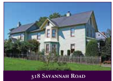
318 SAVANNAH ROAD