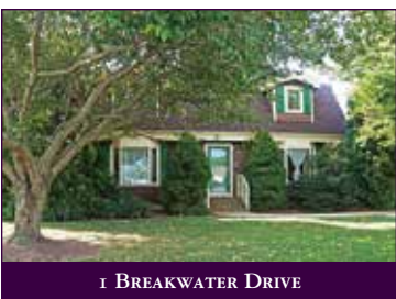
1 BREAKWATER DRIVE