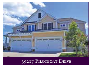
35217 PILOTBOAT DRIVE