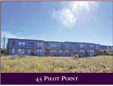
43 PILOT POINT