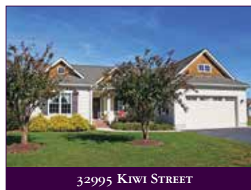
32995 KIWI STREET