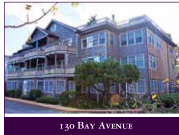
130 BAY AVENUE