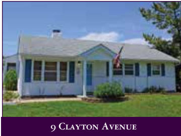
9 CLAYTON AVENUE