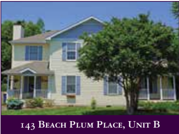
143 BEACH PLUM PLACE, UNIT B