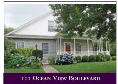
111 OCEAN VIEW BOULEVARD