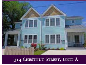
314 CHESTNUT STREET, UNIT A