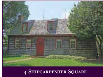
4 SHIPCARPENTER SQUARE