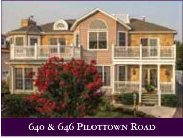
640 & 646 PILOTTOWN ROAD