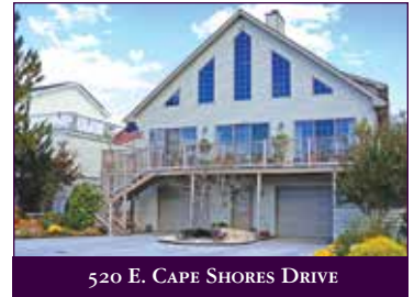
520 E. CAPE SHORES DRIVE