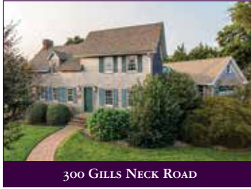
300 GILLS NECK ROAD