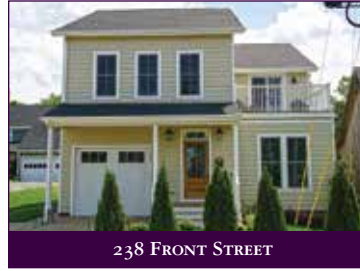
238 FRONT STREET