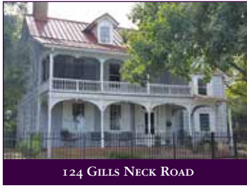
124 GILLS NECK ROAD