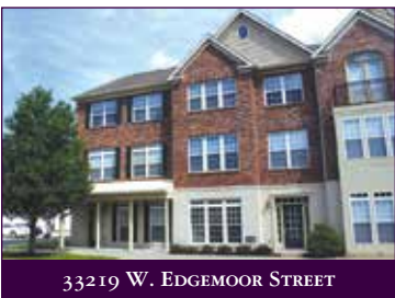
33219 W. EDGEMOOR STREET