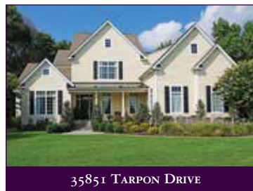
35851 TARPON DRIVE