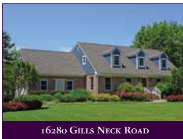
16280 GILLS NECK ROAD