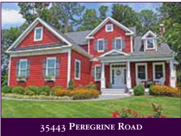
35443 PEREGRINE ROAD